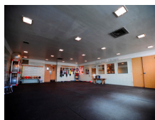
Fitness room above. Golf room below.

Hoffman Hall has a heated, Olympic size indoor pool, with men and women's locker rooms containing full size lockers and hot showers. The gymnasium contains a full-sized basketball court, or two half size courts for recreational play. Alternately, three volley ball nets can be set up in the gymnasium.