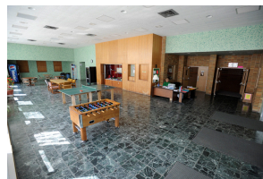
Lobby area with kitchen in the back.

The large lobby/meeting area, complete with tables and chairs, is located on the sunny south side of the building. With it's high ceiling and marble floor, it is the perfect place to hold your conference or family gathering. A concessions kitchen is available for simple food preparation and service. Tables and chairs can be provided to accommodate up to 100 people.